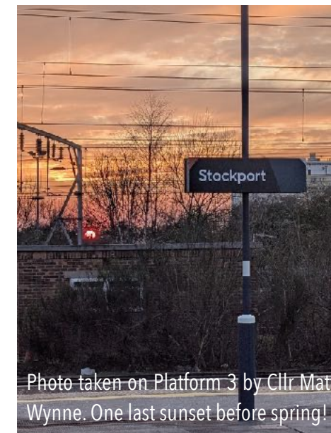
Photo taken on Platform 3 by Cllr Matt Wynne. One last sunset before spring!

At the last Central Area Committee, the ECA called in Network Rail and Avanti West Coast for updates on preparation for the closure of Greek Street Roundabout and proposed works to the station.